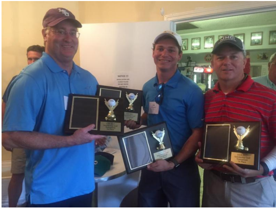
2017 LGA Golf Tournament WINNERS!

Thank you to our generous sponsors and wonderful volunteers that made this event possible!