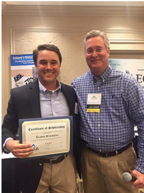
Click on the image above to view highlights and pictures from the 2016 Annual Operations Conference!

P.O. Box 82531 Baton Rouge, LA 70884 P: (225) 218-6885 F: (225) 767-7648 E: LGA@tatmangroup.com Visit Our Website